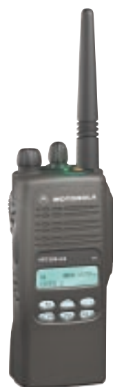
HT1250-LS with LTR® Trunking